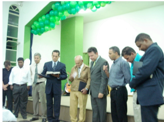
Elders from Zion