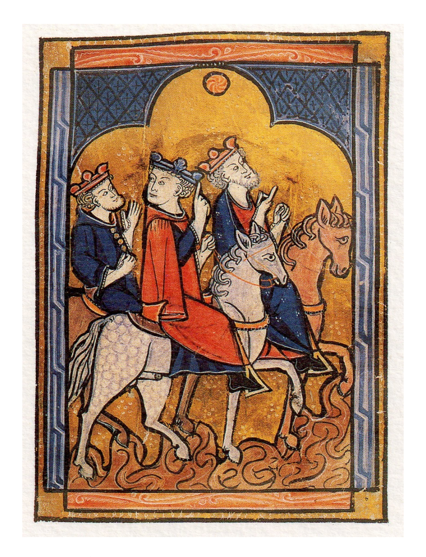
The Epiphany of God Third Sunday of Christmas