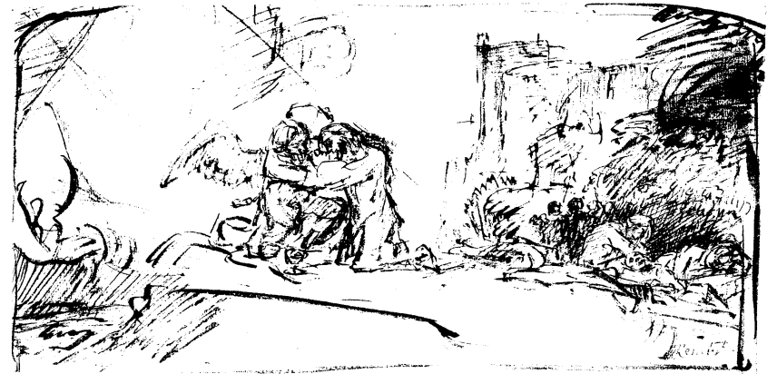
Christ Consoled by the Angel on the Mount of Olives